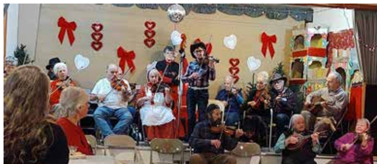
District 7 Sweethearts at the Eagle Creek Grange