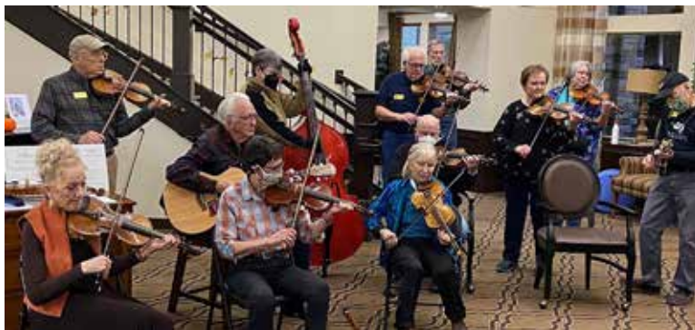
District 7 at Bonaventure Retirement Community