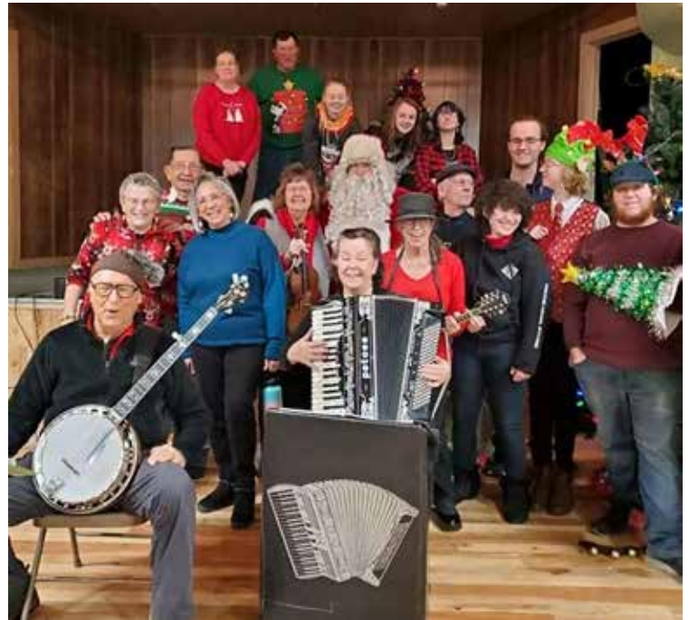
District 3 Members were in a festive, holiday spirit at the Terrebonne Grange

make sure the venue is safe for the audience to sit and listen to the music and that there's room to dance if they choose.