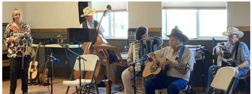
District 3 members at Powell Butte Community Center. They are the hosts of the Central Oregon Acoustic Music Gathering coming up, September 16 & 17