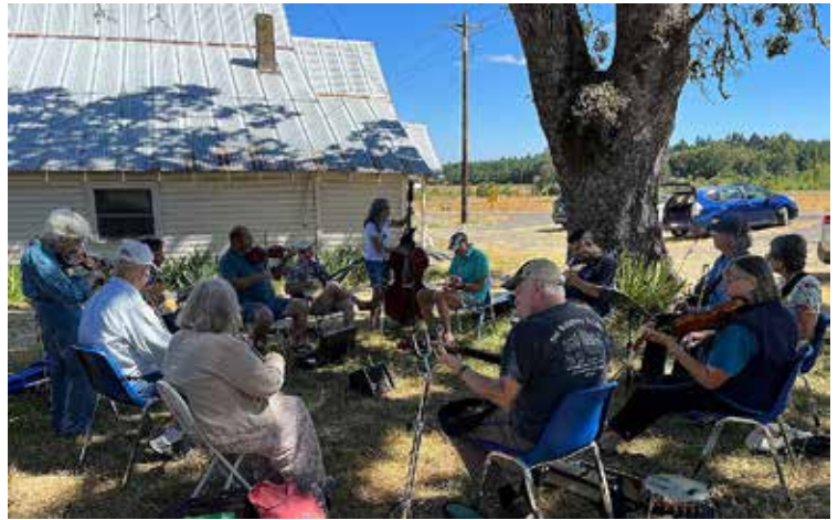
The old oak tree by Central Grange created the perfect environment for an outdoor jam

In August, District 6 had two groups that played at the First Friday ArtWalk in downtown Eugene. Overheard was, "this is the hoppinest place on the Artwalk". We played a gig at Willamette Oaks Retirement Community on August 10, where many members of the audience were seen singing along with the old favorites that we played. The third gig of the month was at Churchill Estates , August 25.