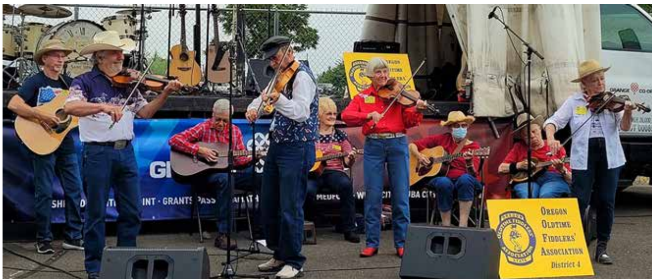
District 4 playing for the BoomFest at the Jackson County Arena on July 4th

gigs for August are RV Park Bonfire/Wiener Roast on the 27th, 7-9 pm and Fiddle Fest on the 3rd, 11-2, sponsored by the United Methodist Church in Medford, in their parking lot. Check the online calendar for any additional gigs. We