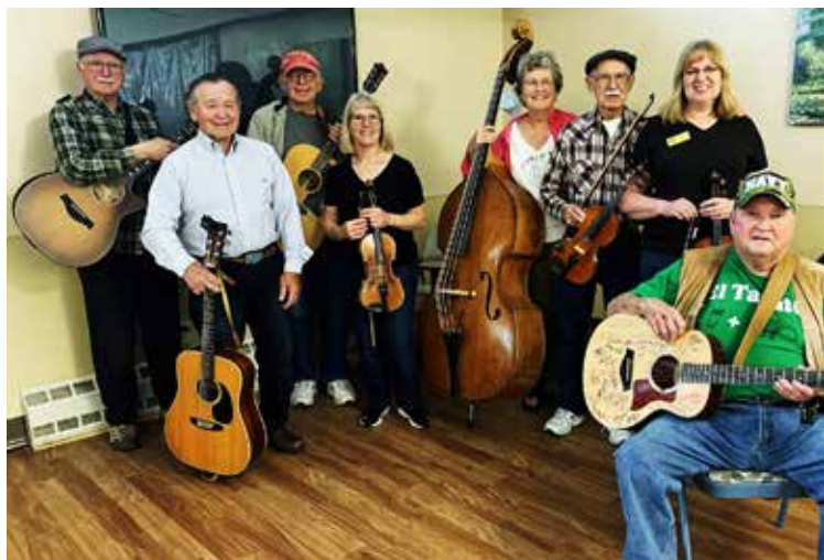
District 10 at Rosehaven Nursing Home