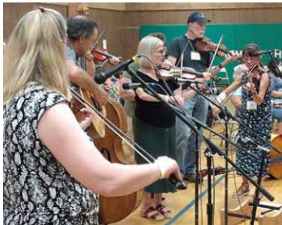
Members from several OOTFA Districts provided music for the Wednesday Night Dance