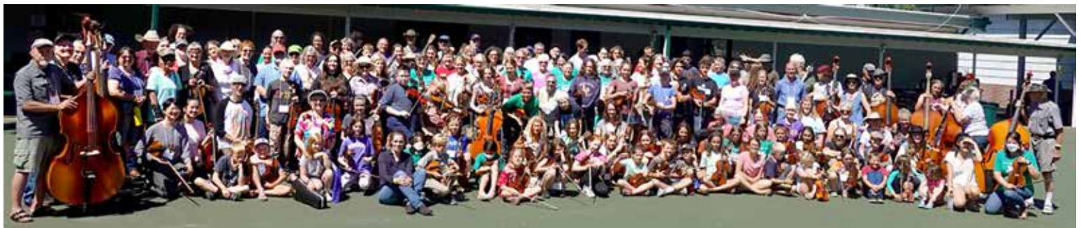
Mothers & Daughters, Fathers & Daughters, Sisters & Brothers Husband and Wife (20th wedding anniversary), New Friends & Old Friends