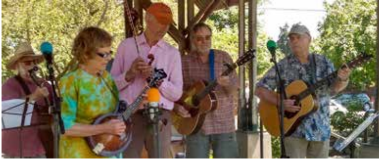
Some of the District 6 members who played at Coburg Days

It is wonderful that we are gathering at Central Grange on second Saturdays but there is something missing. We may be having a ball circle jamming and enjoying good conversation, but we don't have anyone to tend to the kitchen. At this time we are not having our beloved potlucks, so it is not a demanding position to fill. We need that volunteer!