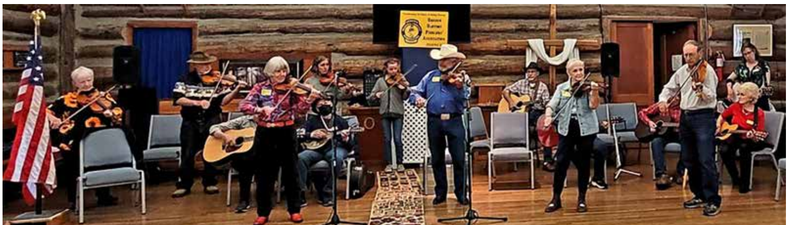
A good turn out of musicians for the District 4 June Jam