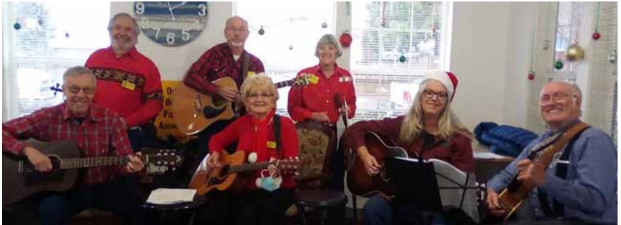
District 4 musicians played for the residents of Morrow Heights Assisted Living in Rogue River