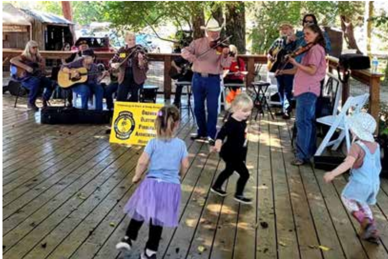
District 4 played for the Harvest Festival at the Pheasant Fields Farm and the little visitors to the farm have fun dancing