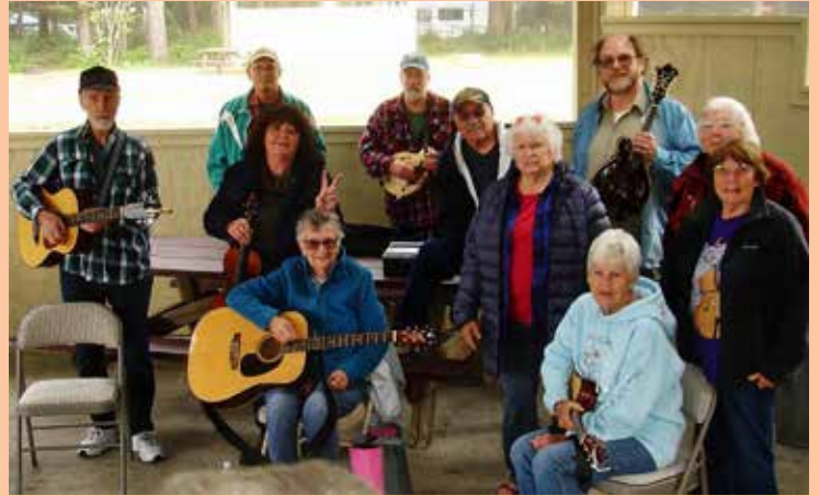
District 5 at the Bastendorff picnic shelter jam