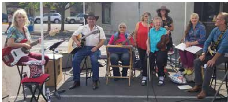
District One Members at the September 2021 Farmers Market in Klamath Falls