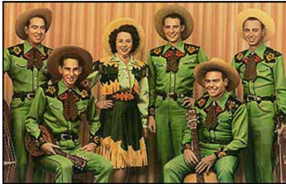
The Maddox Brothers & Rose

With their eclectic and stylistic music, the Maddox Brothers and Rose are credited with being on the forefront of the rockabilly movement. Their musical mix made them sound like a cross between a 1930s old-time string band and a rock-n-roll band of the late 50s. Rose continued performing and recording, with several highly-acclaimed albums in both the bluegrass and country genres. A good read is the 1996 book, by Johnny Whiteside, entitled "Ramblin' Rose, The Life and Career of Rose Maddox." Ken Burns' 2019 documentary about Country Music discussed the contributions of The Maddox Brothers and Rose in episodes two and three.