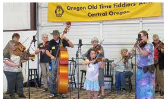
Central Oregon Country Music Gathering, 2019

The gathering in Prineville, hosted by District 3, has become quite popular and is centrally located in the state which means that folks from all over Oregon attend. It has been a great venue to meet members from far away. It was to be the site of the September OOTFA Board Meeting . Once again, board members will meet via ZOOM instead.