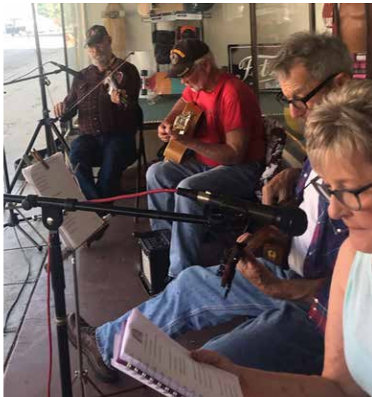
District One and 1E at the E Street Jam in Lakeview