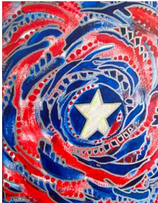
"Stars & Stripes"

work. By invitation, in July and August 2022 she will have a one-artist show at Salem Hospital (Legacy) . Her award-winning painting 'Stars and Stripes' is currently displayed at Keizer City Hall . Her art, and much of it is music/violin themed, will soon be available on prints and cards, so stay tuned.