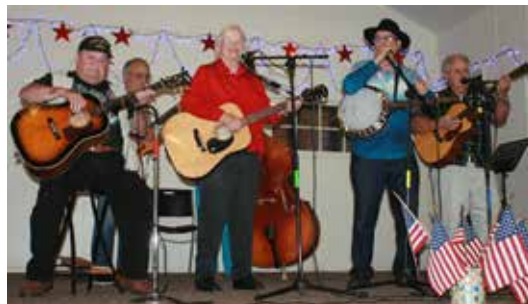
Fiddle at the Beach, 2018

Fiddle at the Beach is one of the most popular OOTFA events of the year. District 5 still plans to have a closed district meeting.