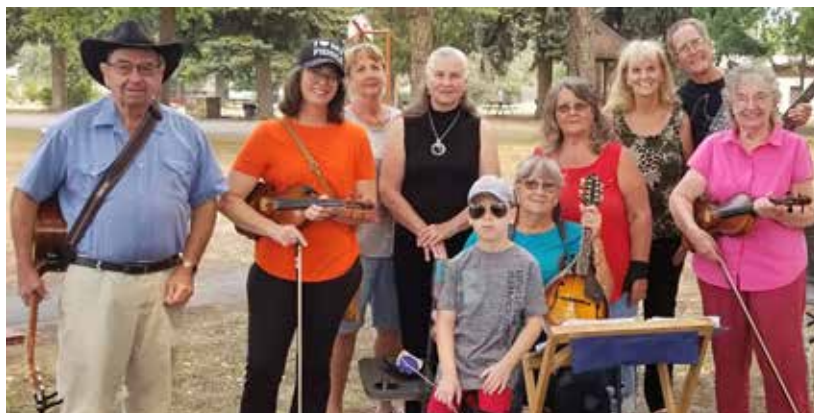
District One members at Wiard Park in Klamath Falls