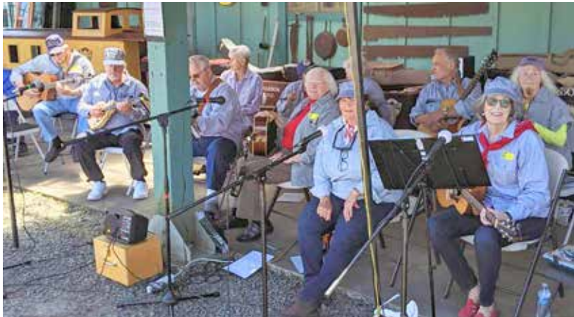
District 5 members showing their support for the Oregon Coast Historical Railway Museum performing some good old-time (and a couple not-so-old) train songs for their post-pandemic re-opening on July 3rd