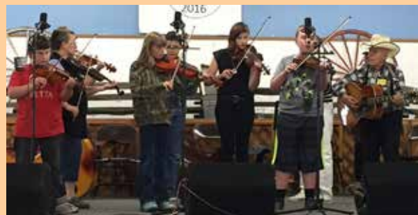
Youth Fiddlers at Harney County Campout