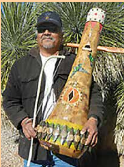
Man with an Apache Fiddle

By the early 1800's fur traders had introduced the fiddle to the Great Lakes area and the Rocky Mountains (Metis), and, by the middle of the century to western Canada and Alaska (Athabaskan).