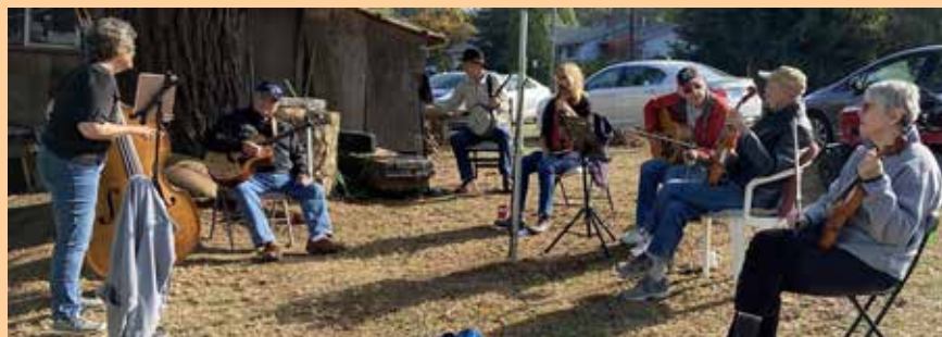
District 10 Driveway Jam