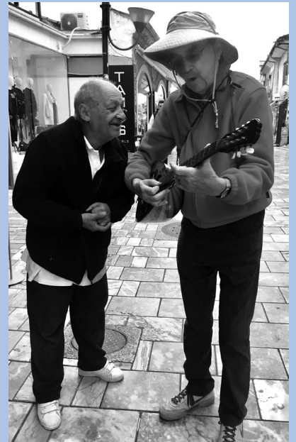
This photo of me in Greece not long ago, trying out a bouzouki lent to me by a street musician: he seems pleased in this picture.

in my college years. It was hard to play because, as I now know, it was not properly set up. I am a bit older now and hopefully much wiser, at least when it comes to setting up instruments. Somewhere in the Middle East, the Arab who pilfered my Sears mandolin from my household effects may be having better luck than I did playing it.