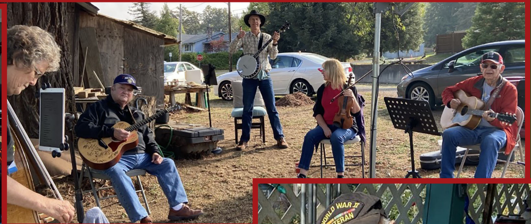
District 10 at the Canyonville Farmers' Market