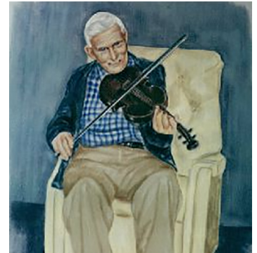
Art from henryreed.org