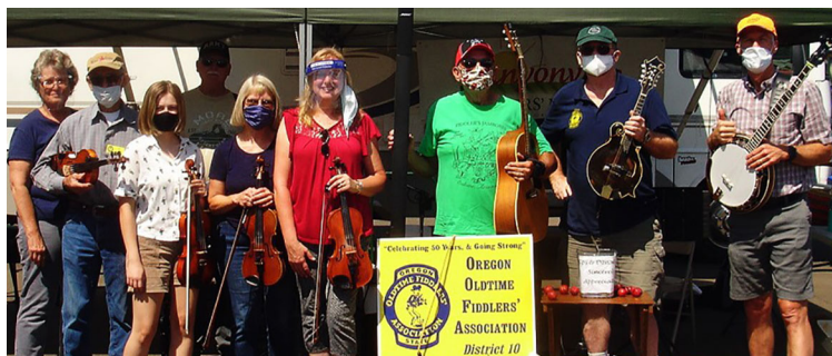
District 10 at the Canyonville Farmer's Market