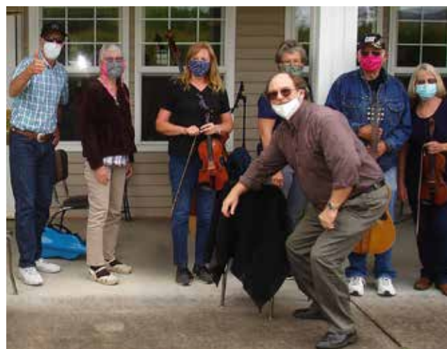
District 10 Fiddlin' Around