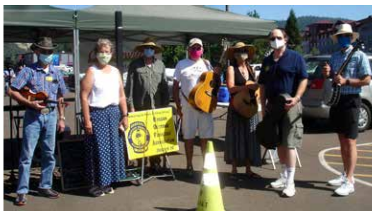
District 10, ready to play music and play it safe

For PDF copy, email Patti at pattiluse@comcast.net