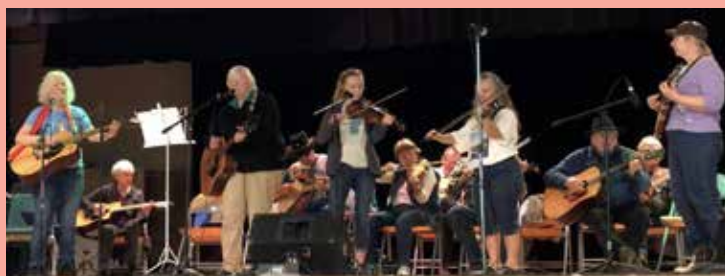
Hauser Fire Department Spaghetti Feed Fund Raiser, March 2019