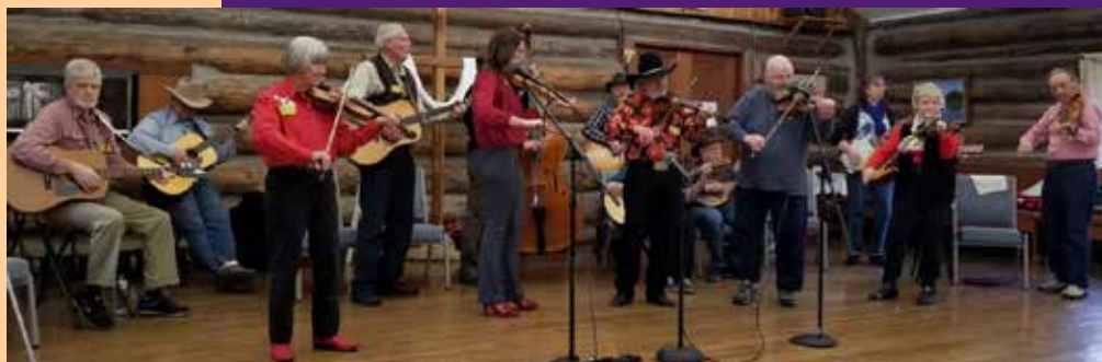
District 4 musicians perform at the monthly jam at the Roxy Ann Grange in Medford