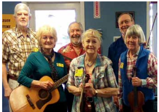
Some district 4 members gather to play for the seniors at the Central Point Senior Center