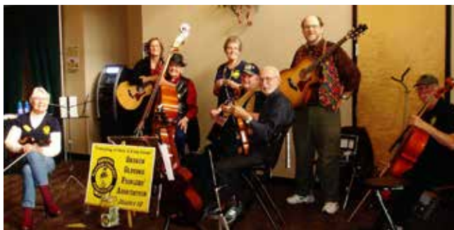
District 10 at the Douglas Co. Fairgrounds Christmas Craft Fair