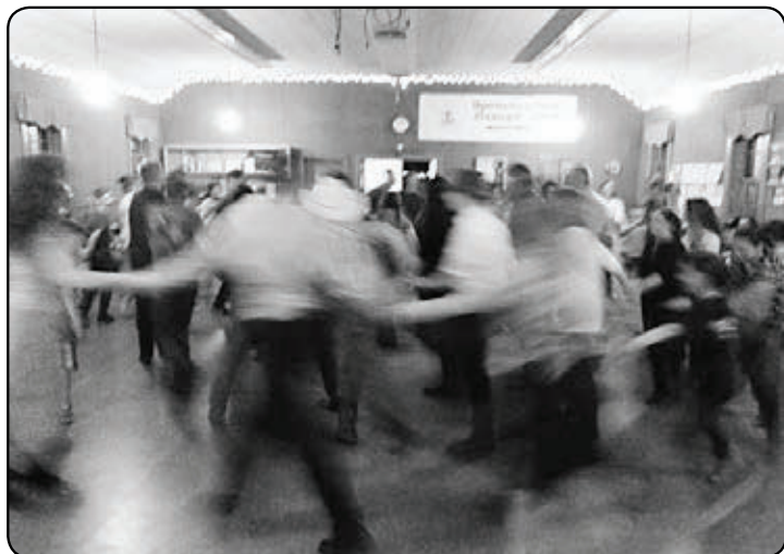
Spencer Creek Barn dance

Our last Barn Dance of the season took place at the Spencer Creek Grange on April 19. What a great turnout!!! We had roughly 100 dancers, and at one point counted 72 dancing the Virginal Reel. It was a HIGH ENERGY crowd in a room filled with young people and children. The "action" photo shows the "cinnamon roll" dance, to the tune of Old Joe Clark, which is always a big hit at the Barn Dance! After that, the band played a slow waltz to let folks cool off if they wanted to, or just come back down to earth gently.