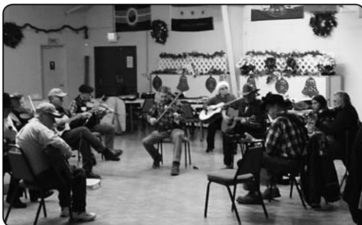
District 3 members circle up for a post Christmas dinner oldtime music Jam.