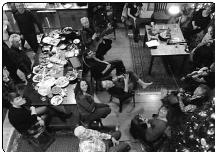
Musical Fun in District 3.