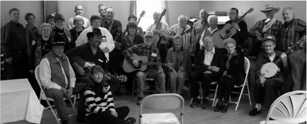
District 1 members gather for the Christmas Party.

Have you renewed for 2011? If not, this will be your last Hoedowner. Get your $20 renewal to your district membership person.