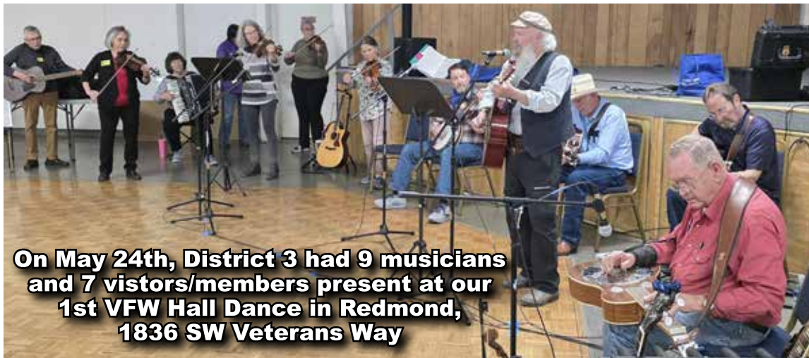
On May 24th, District 3 had 9 musicians and 7 visitors/members present at our 1st VFW Hall Dance in Redmond, 1836 SW Veterans Way