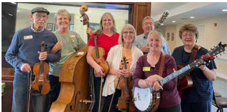
District 10 at Brookdale