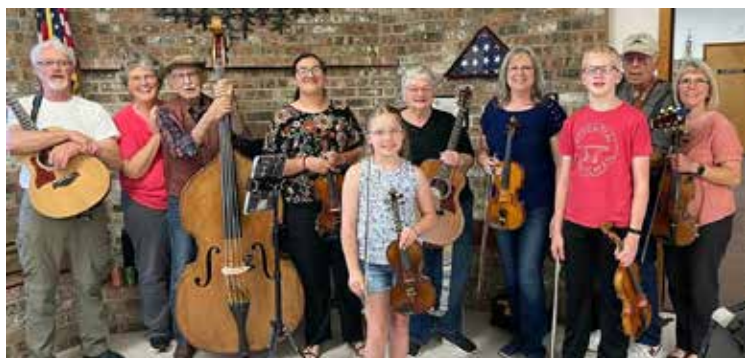
District 10 at Timber Valley RV Park