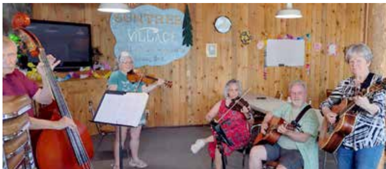
District 3 Fiddlers jammin' at Suntime Village