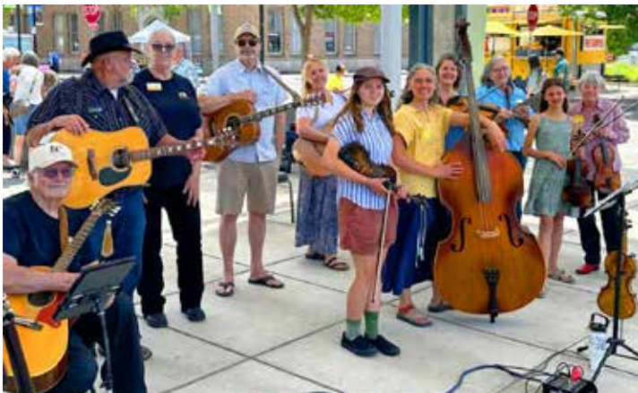
Young fiddlers have become a wonderful addition to the District 4 monthly jams

As always, the show would not go on without support from various people and organizations. I would like to thank the Keilhorn Foundation as well as OOTFA Districts 6, 8, and 10 for their generous donations to this event.