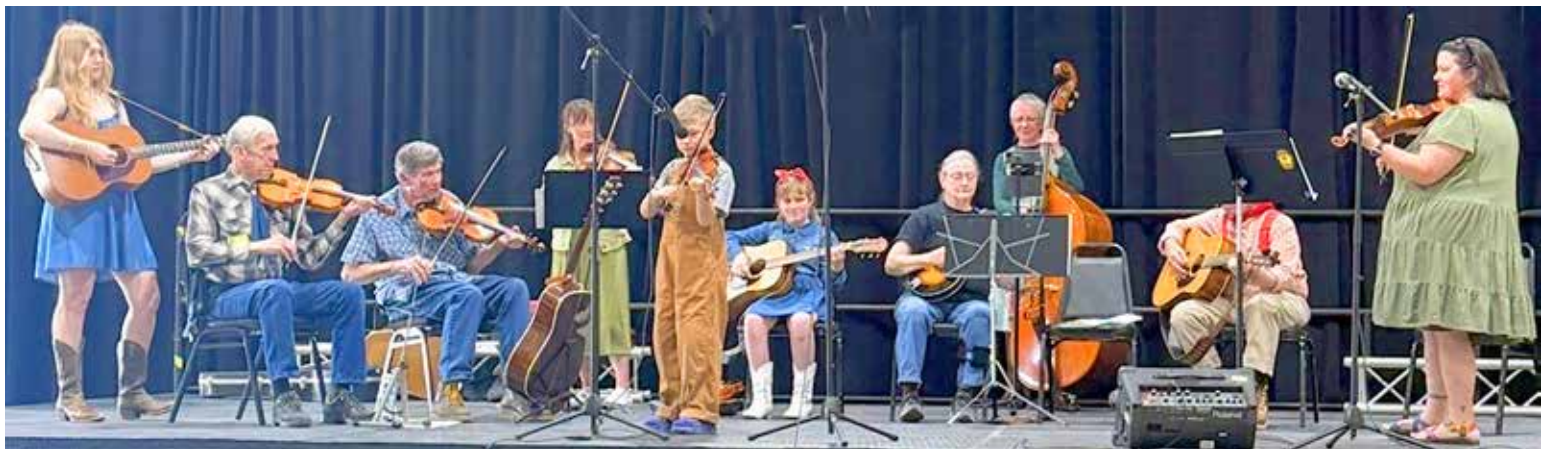
District 8 played at Ag Fest at the Oregon State Fairgrounds on April 25th