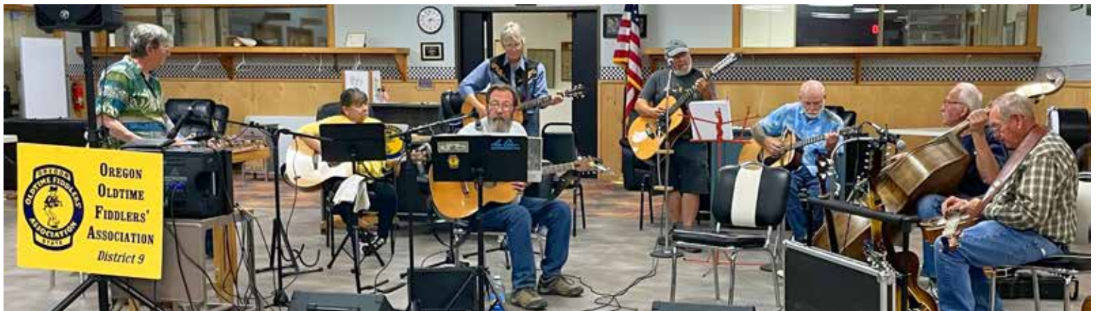
Good sounds coming from this bunch at the District 9 Monthly Jam in May