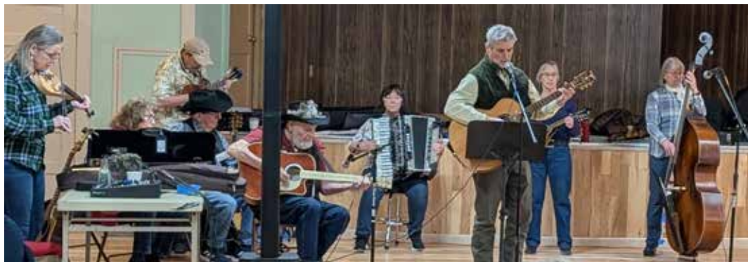
District 3 plays the 4th Sunday of every month at the Terrabonne Grange