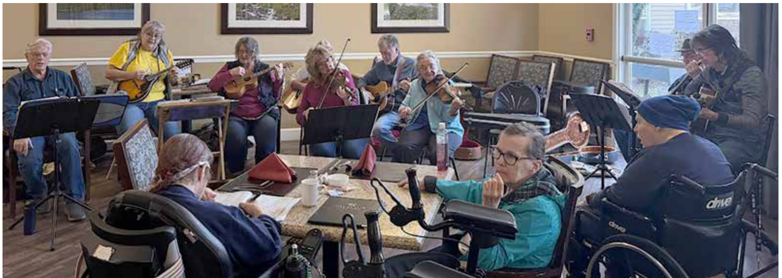
District 1 members entertain the residents of Pacifica Care in Klamath Falls