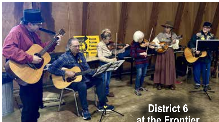
District 6 at the Frontier Heritage Fair