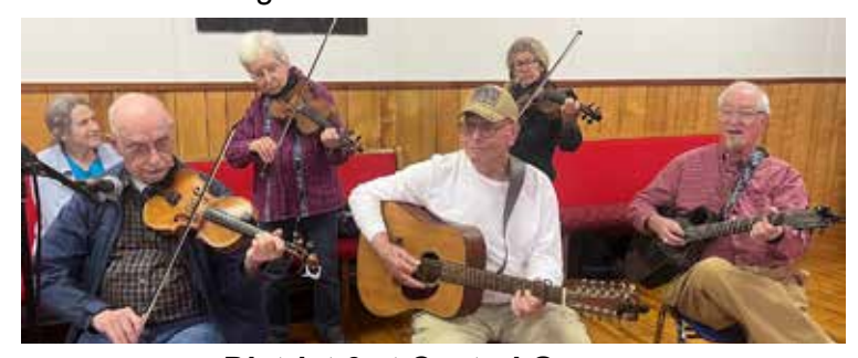
District 6 at Central Grange

More than 2 dozen members of District 6 traveled to Winston (near Roseburg) for 3 days of music and camaraderie. I much enjoyed the varied music making, interesting workshops, and jamming till my fingers would do no more. Thanks to District 10 and the organizing committee for all their work making this a fine event.