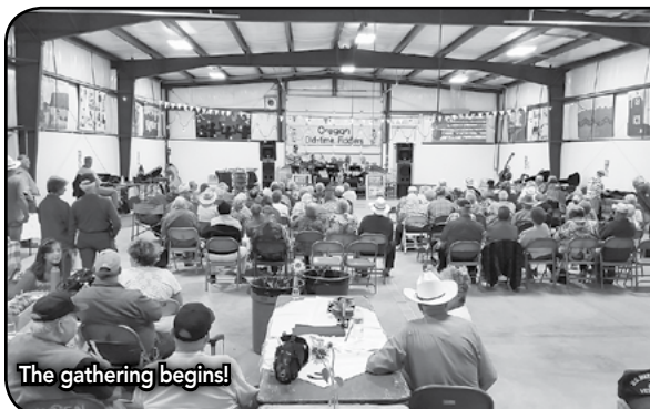
The gathering begins!