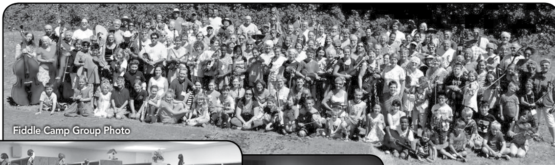
Fiddle Camp Group Photo