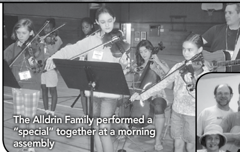
The Alldrin Family performed a "special" together at a morning assembly