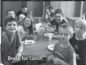
Break for Lunch