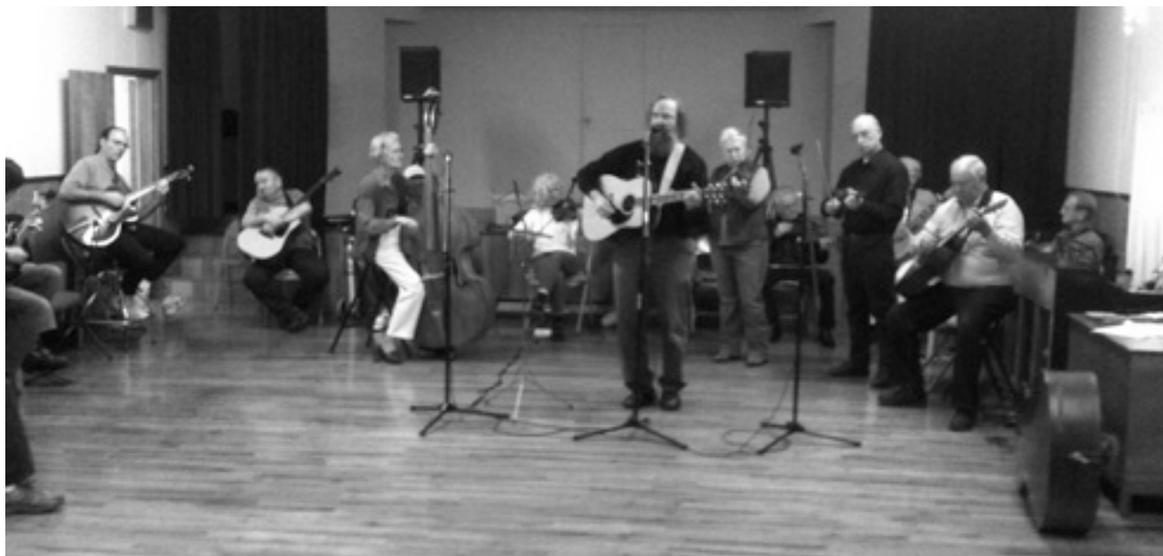
District 6 meeting and jam Oct 9th, 2010

Time to renew for 2011! Get your $20 renewal to your district membership person.